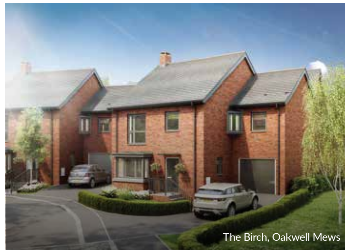
The Birch, Oakwell Mews