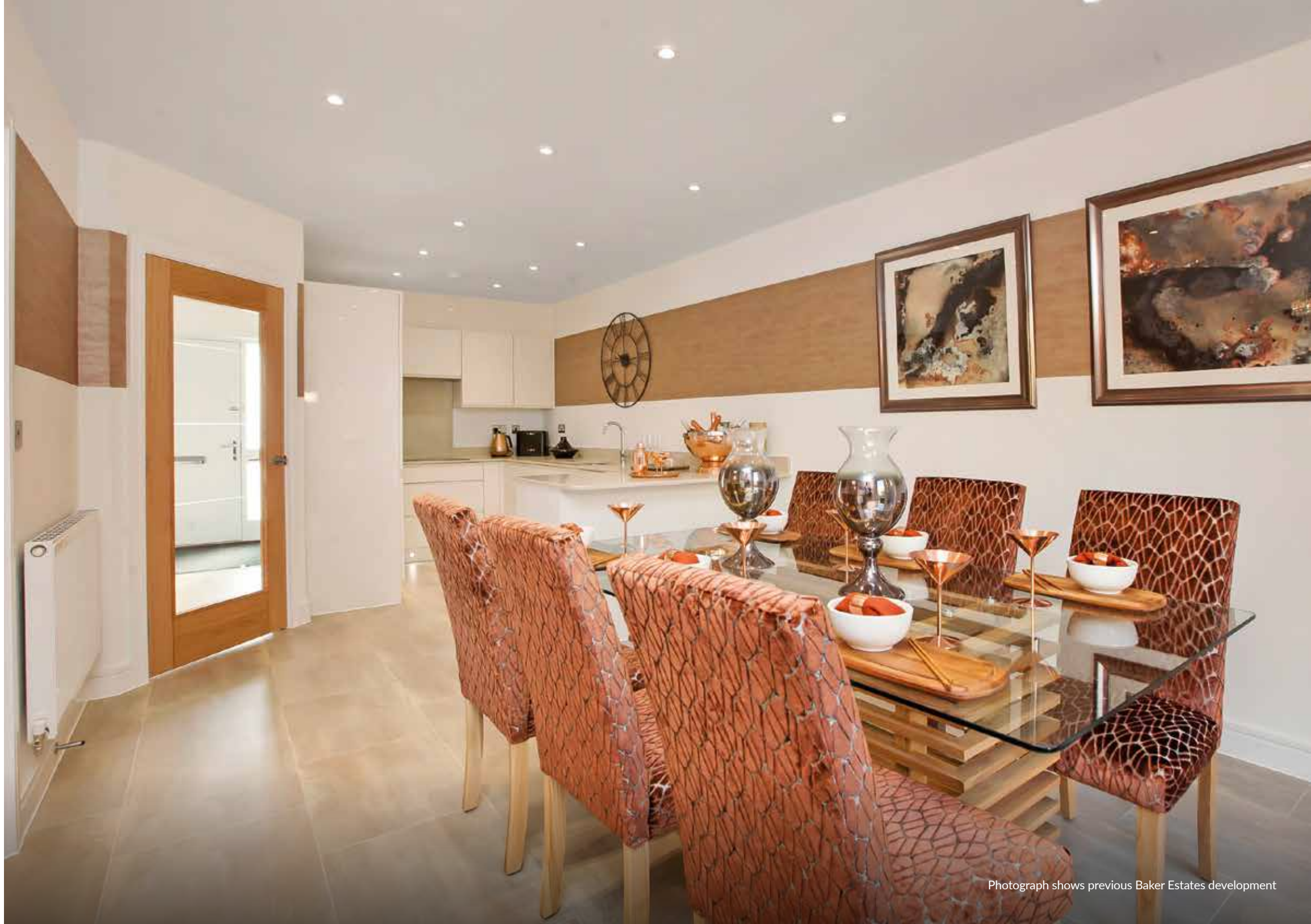
Photograph shows previous Baker Estates development