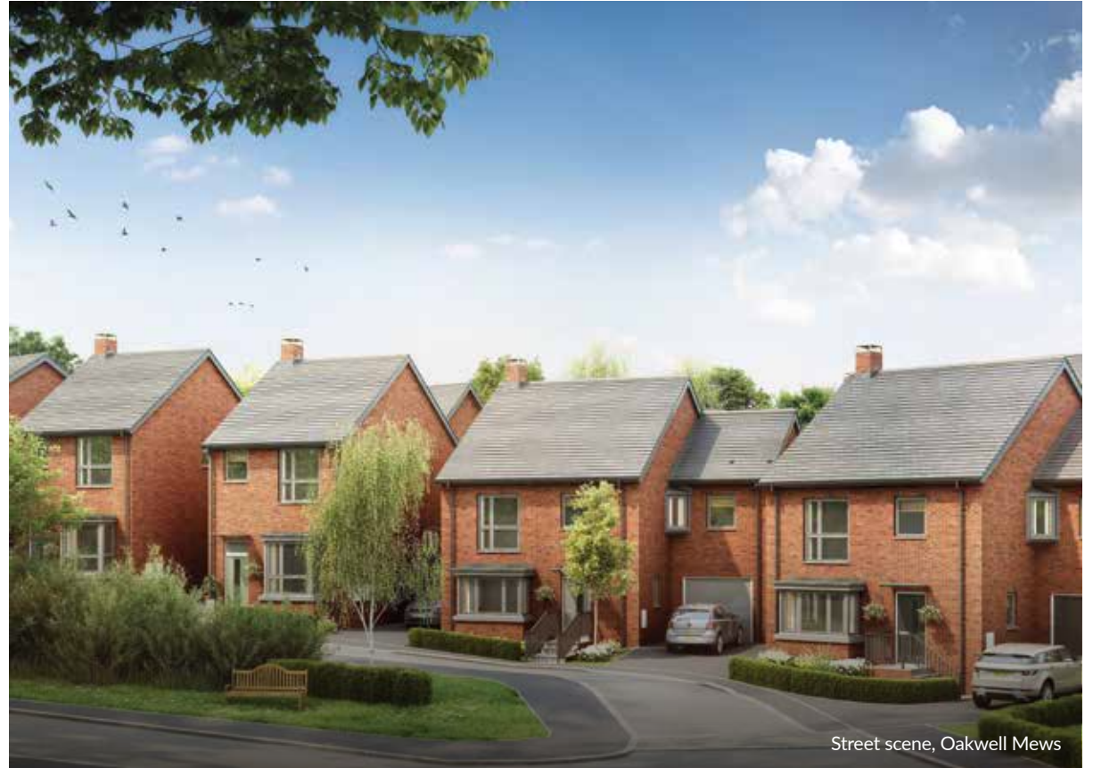
Street scene, Oakwell Mews