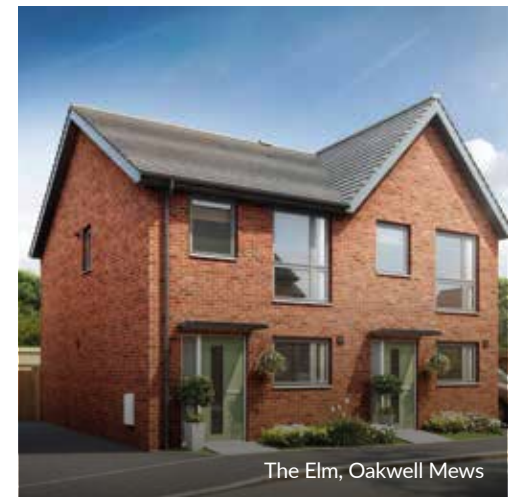
The Elm, Oakwell Mews