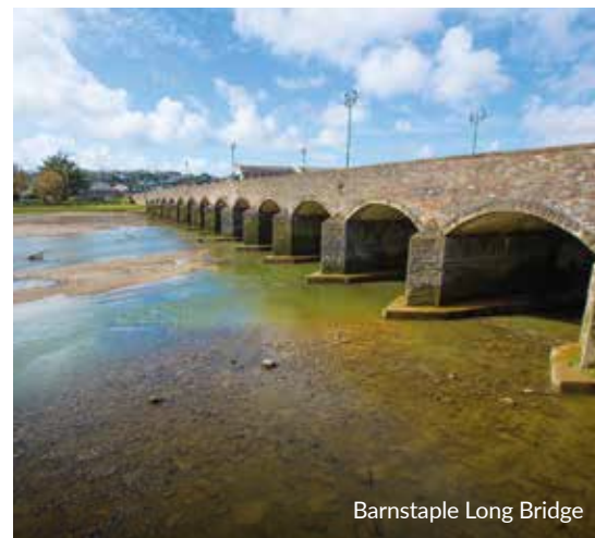
Barnstaple Long Bridge