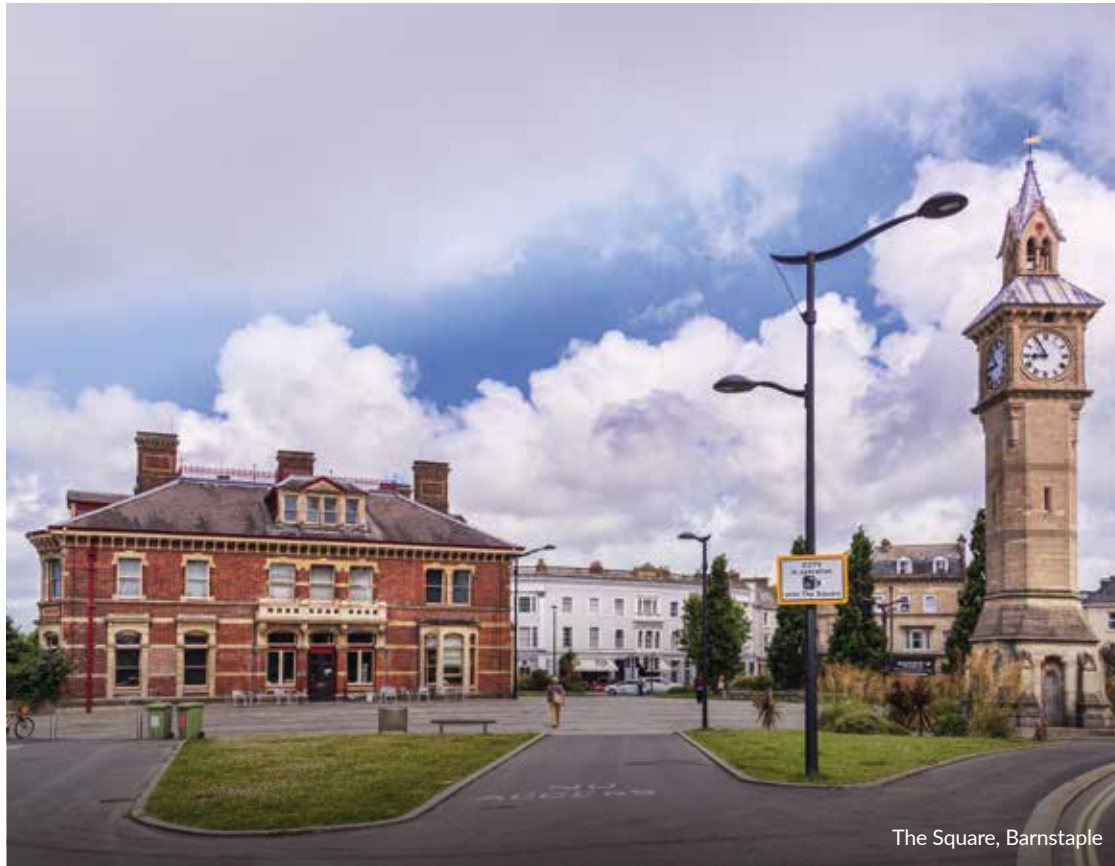
The Square, Barnstaple