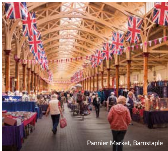
Pannier Market, Barnstaple

Oakwell Mews is a short drive from Barnstaple station. This local train station offers a sprinter train service that runs to the cathedral city of Exeter, with a journey time of just over one hour. The North Devon link road (A361) gives simple access to the M5 motorway at junction 27. A short walk to the nearest bus stop on Bickington Road offers regular bus services to the nearby towns of Barnstaple, Bideford, Ilfracombe and Westward Ho!