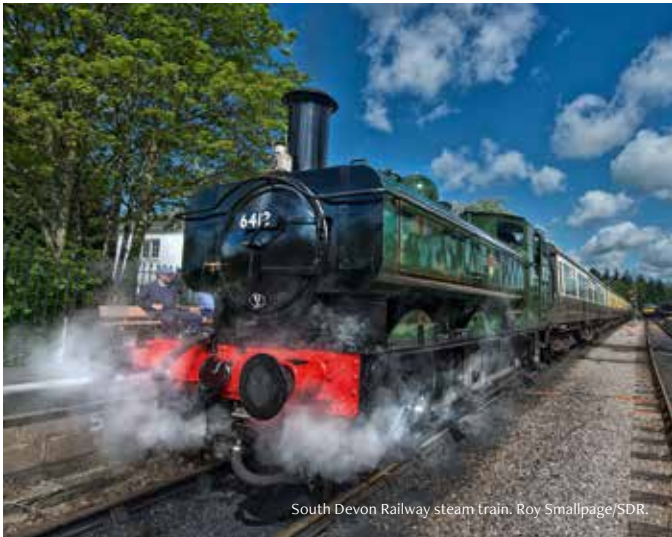
South Devon Railway steam train.