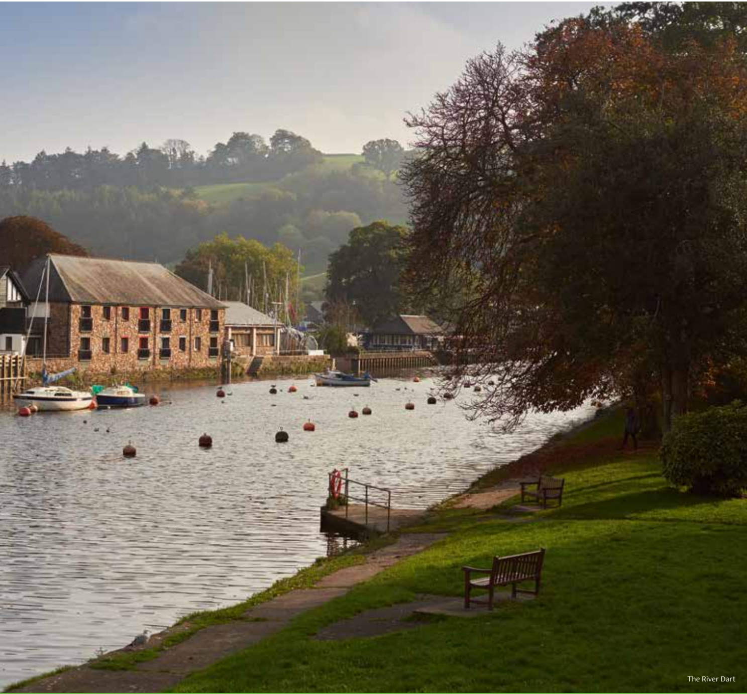
The River Dart