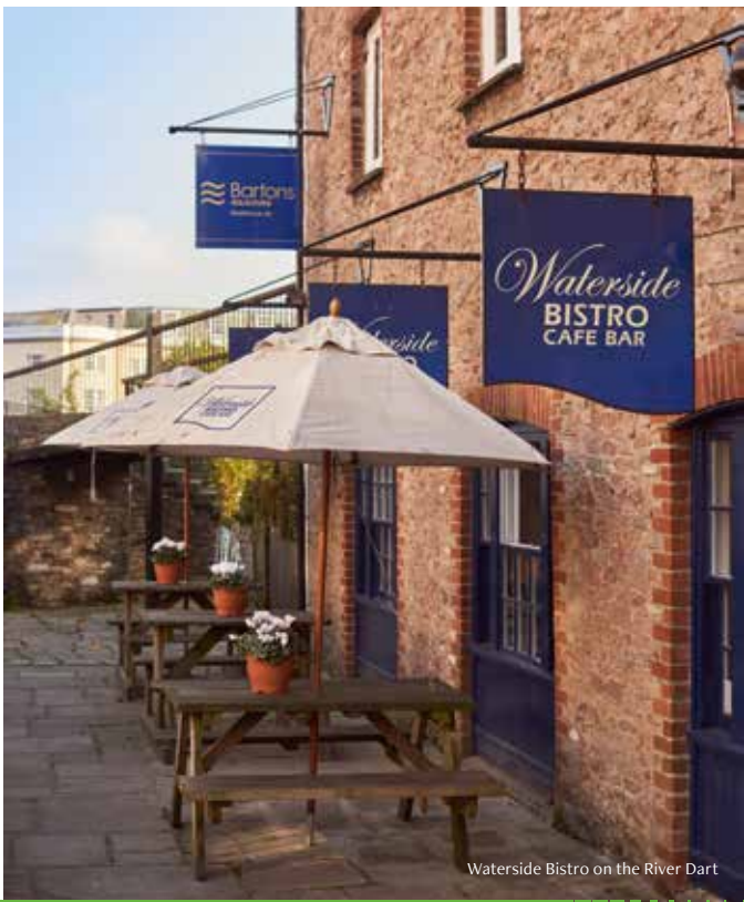
Waterside Bistro on the River Dart