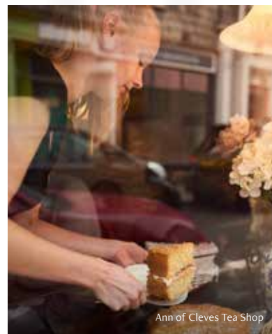
Ann of Cleves Tea Shop