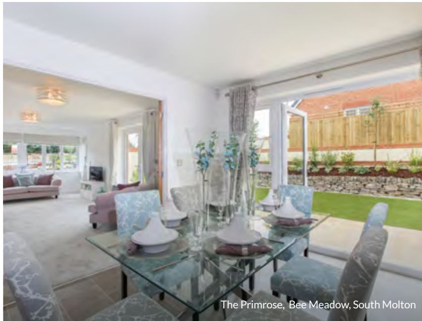
The Primrose, Bee Meadow, South Molton