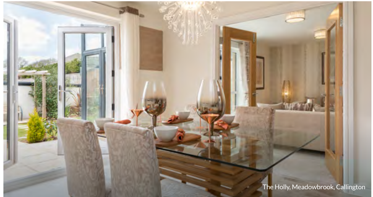
The Holly, Meadowbrook, Callington