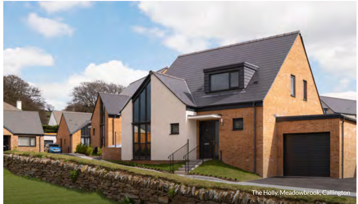
The Holly, Meadowbrook, Callington

Baker Estates – good things happen here.