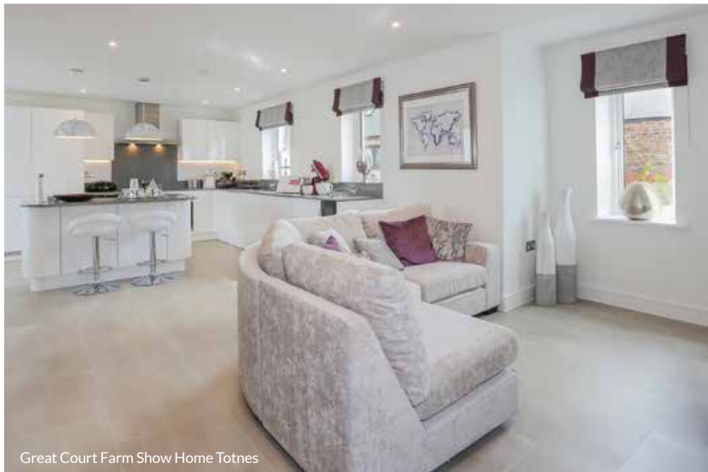
Great Court Farm Show Home Totnes