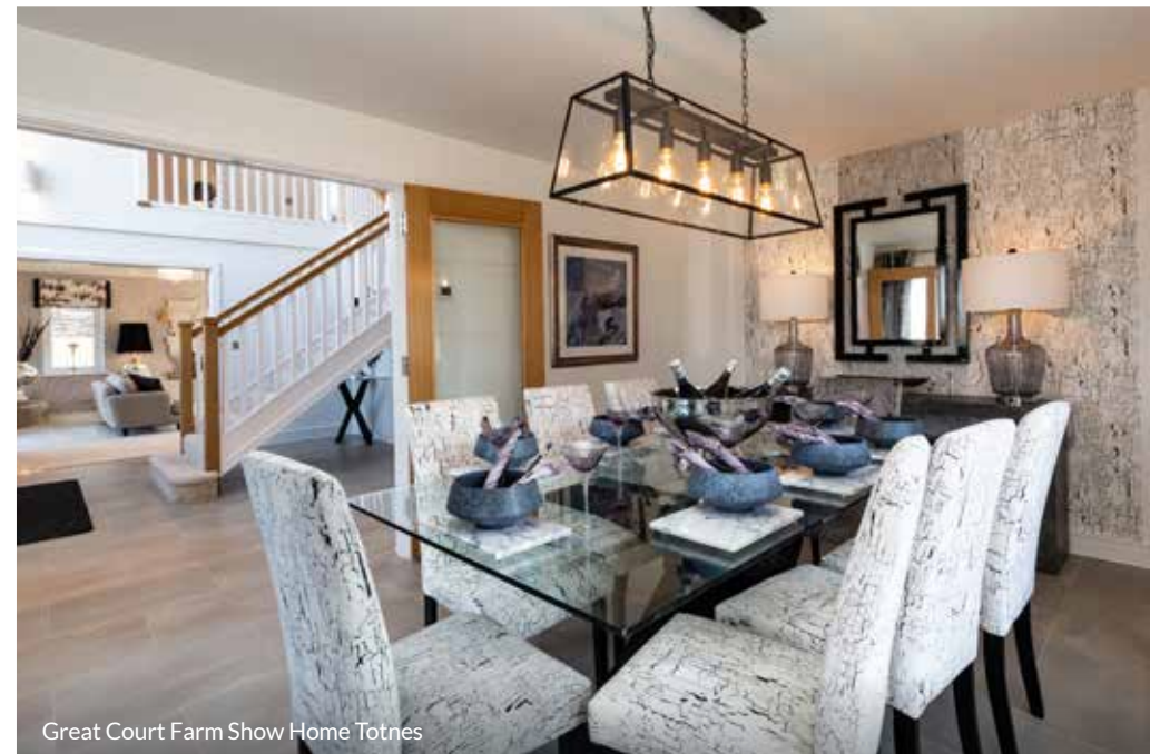
Great Court Farm Show Home Totnes