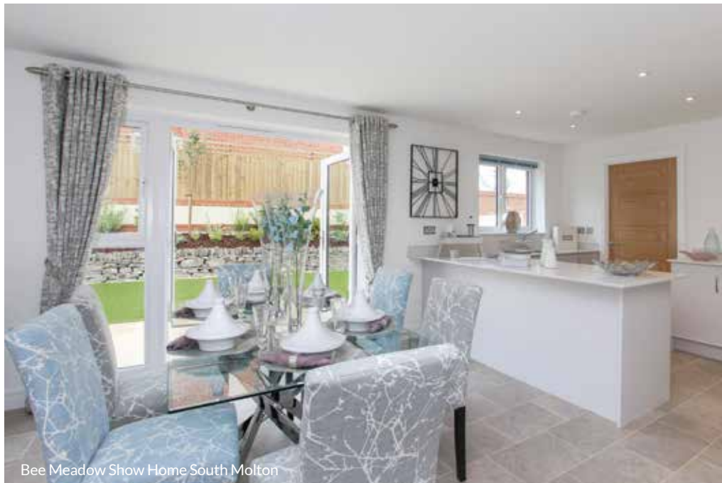
Bee Meadow Show Home South Molton