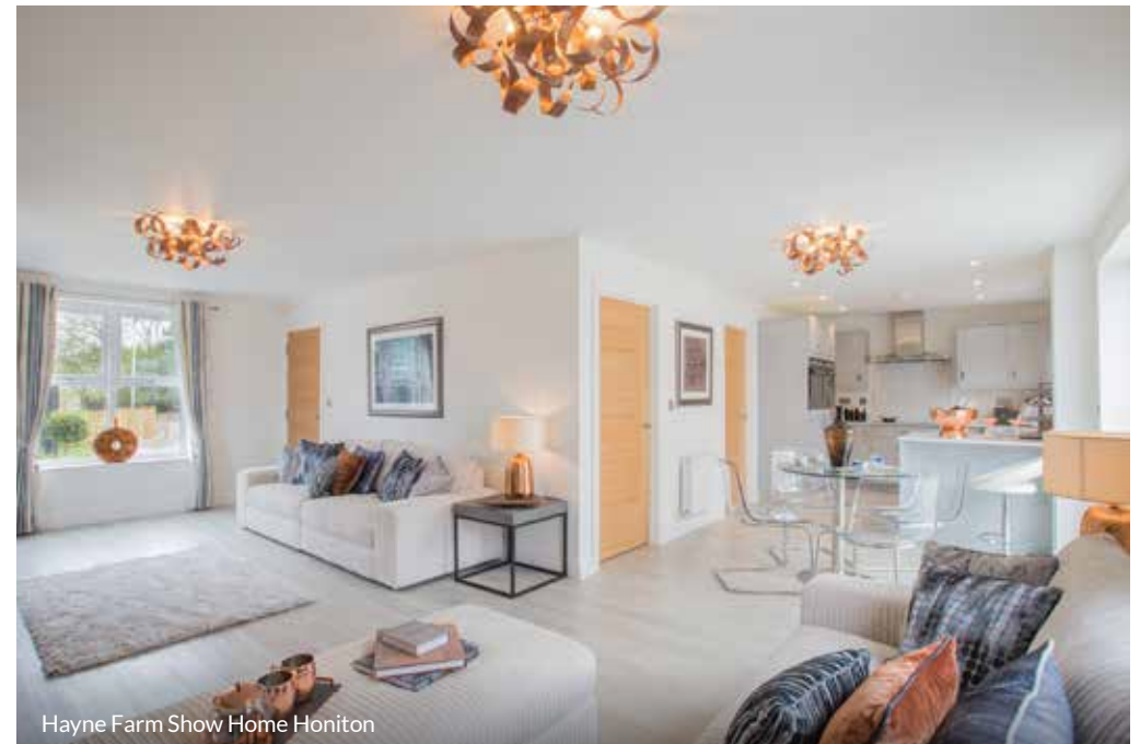
Hayne Farm Show Home Honiton