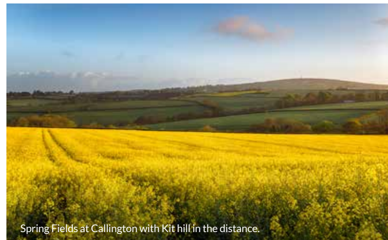
Spring Fields at Callington with Kit hill in the distance.

Now in its sixth year, the town also hosts Mayfest, a street entertainment festival which includes music, dance, fun and laughter for all the family.