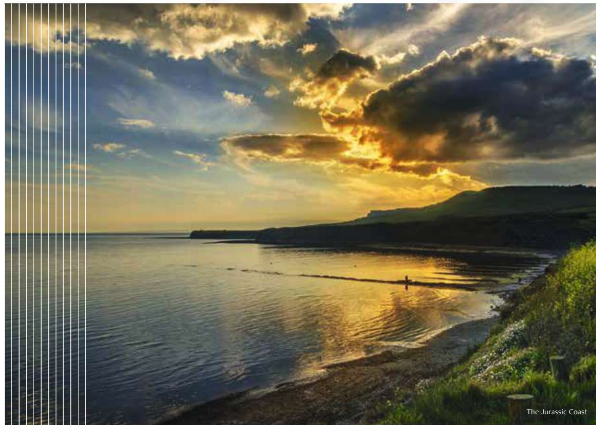
The Jurassic Coast