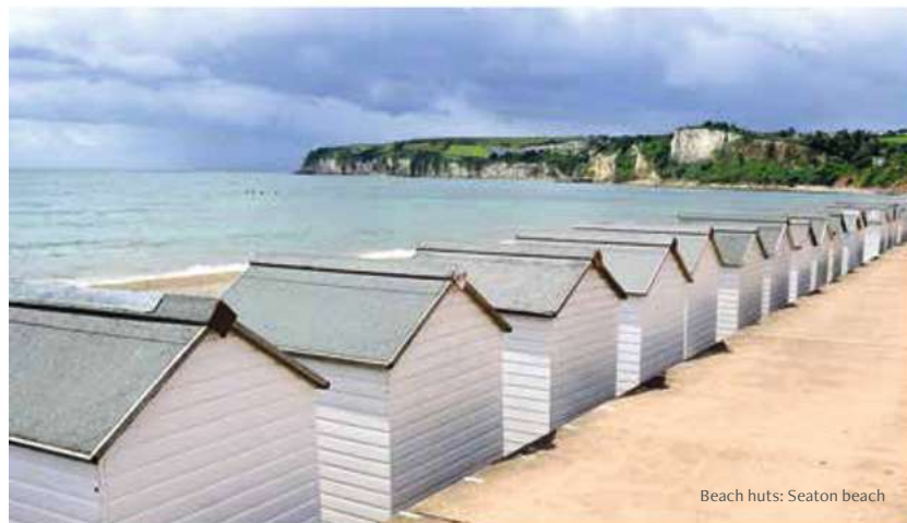
Beach huts: Seaton beach