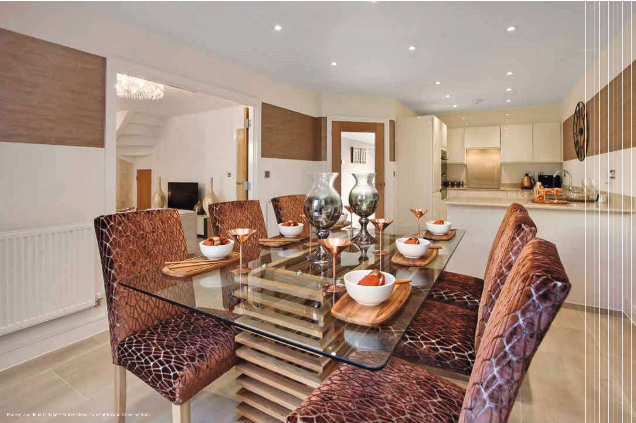
Photography depicts Baker Estates Show Home at Rowan Drive, Seaton.

CGIs are indicative only and may be subject to change.